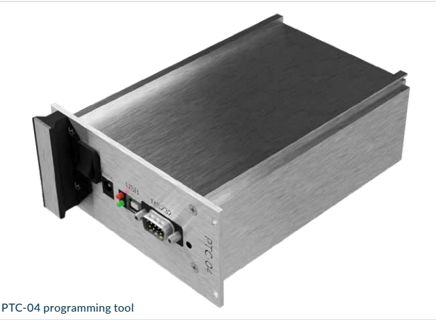
PTC-04 programming tool

Communication is done through a standard RS-232 null modem cable to a COM port of the PC or via USB. The PC requires no custom configuration, allowing the programmer to be used with any PC with a COM port speed of 115.2kbs or a standard USB 1.1 or USB 2.0 (Type A) interface.