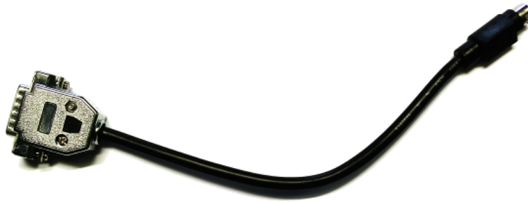
Figure 1 - CablePTC04- A3

It should be used during the development of the EOL programming sequence on the PTC04 for the Melexis IC mentioned above.